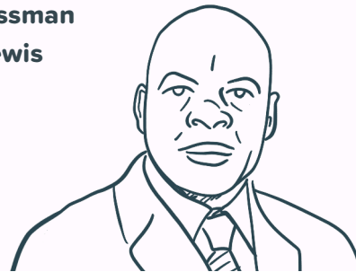
Congressman John Lewis